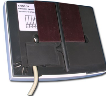
Figure 1. The cable is led through the outlet

S-208997 can be mounted on a wall or a device box (cc 60 mm). It can also be mounted on a cabinet front using the supplied magnetic tape. The magnetic strips are pasted onto the back of the unit. When using this mounting, the cable should be led through the alternate outlet at the bottom of the wiring compartment. See Figure 1.